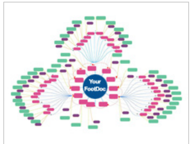
4. High rank incoming links